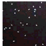
Ebony & Ivory