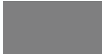
NICKEL SILVER 304 ⚡★