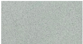
PEPPER GRAY 765 ★