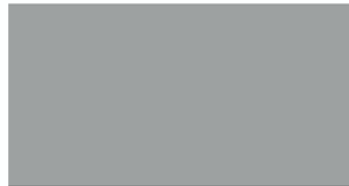
GREY DAWN 700 ⚡