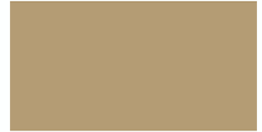
DESERT TAN 500 ⚡