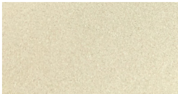
DESERT SPECKLE 365 ★