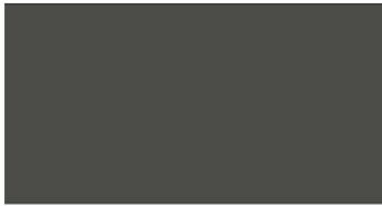
GRAPHITE 790 ⚡