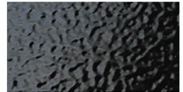
TEXTURED BLACK 091 ⚡